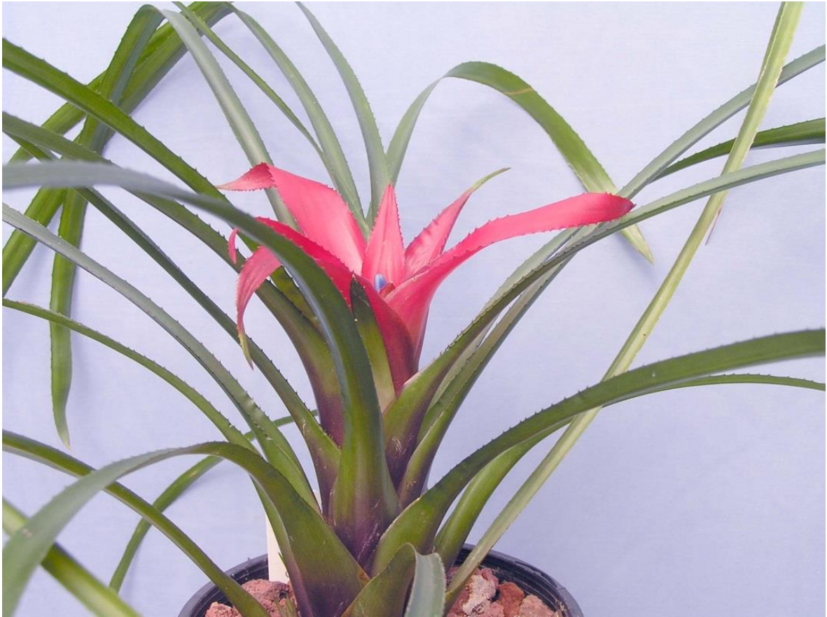
Nidularium cariacense .

Last month started the discussion of the genus Nidularium , and this month finishes it.